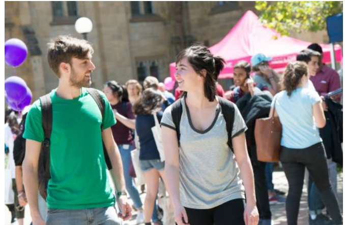
“South Lawn Orientation Day 2017”

The University has undertaken some high-level mapping of our sustainability activities against the SDGs as part of recent sustainability reports. We have also started to embed the SDGs in our thinking for campus and precinct planning. A localization process appears to be a sensible next step if we want to take these reporting and campus planning activities to the next level.