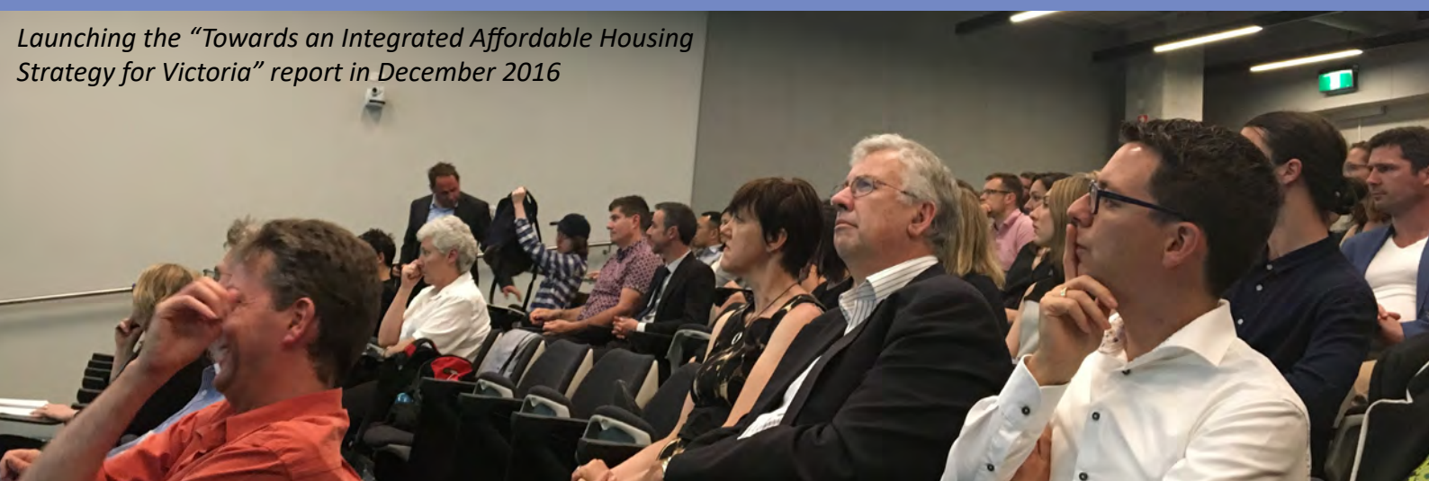
Launching the "Towards an Integrated Affordable Housing Strategy for Victoria" report in December 2016

Our Participatory Action Research aims to engage with interested stakeholders, and be applied, relevant and focused on influencing positive change. For this reason, we value your input and look forward to continued collaboration in 2017