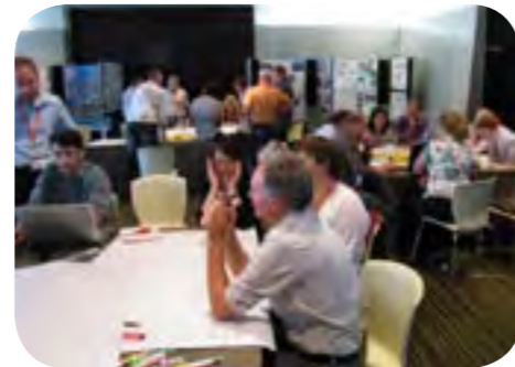
The Arup's Charrette in progress

Part of the conference included a charrette. This has proven to be a very popular workshop on the city's future with 90 participants from all over Australia including 10 graduate students from the faculty who presented their studio work from last semester to inform the charrette. These students were also interviewed and contributed to an SBS Insight program featuring panelists drawn from the speakers. The key stakeholders for this event are the City of Melbourne, Dept Infrastructure, Government Architect's Office, DSE(Urban Design) and Federation Square. A